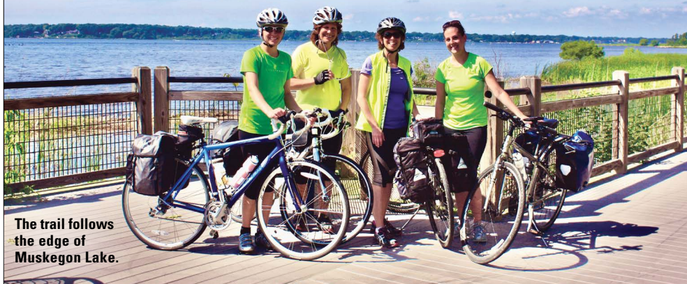
The trail follows the edge of Muskegon Lake.

was built on an abandoned rail bed that runs parallel to Laketon Avenue. To connect with the other trails at either end, you must ride along some city streets. To connect with the Muskegon Lakeshore Trail, head west on Southern Avenue and north on Division Street. To connect with the Musketawa Trail, ride south through the industrial park to the trail entrance just north of East Sherman Boulevard on Black Creek Road.